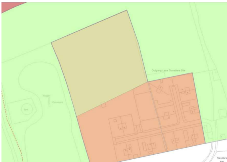
Figure 5: Proposed policy map modification December 2022 (For illustration purposes only)

4.8 A revised modification based on the above would ensure the Council owned site at Osbaldwick has capacity to deliver the 4 pitches identified as part of the CYC provision and the likely additional requirements generated through development of some of the Plan's allocated sites. It is an approach that provides flexibility and secures a requisite level of certainty that future pitch needs can be met.