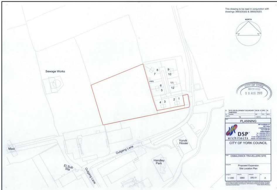
Figure 4: Approved site location plan (application reference 13/02704/GRG3)

4.8 A revised modification based on the above would ensure the Council owned site at Osbaldwick has capacity to deliver the 4 pitches identified as part of the CYC provision and the likely additional requirements generated through development of some of the Plan's allocated sites. It is an approach that provides flexibility and secures a requisite level of certainty that future pitch needs can be met.